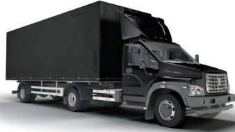
DROPSIDE TRUCK WITH CANOPY