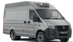
ALL-METAL REFRIGERATOR VAN