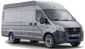
FREIGHT ALL-METAL VAN