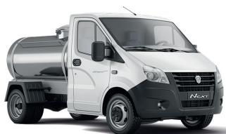
FOOD TANK TRUCK