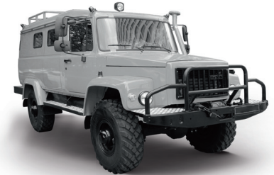
HIGH PERFORMANCE VEHICLE